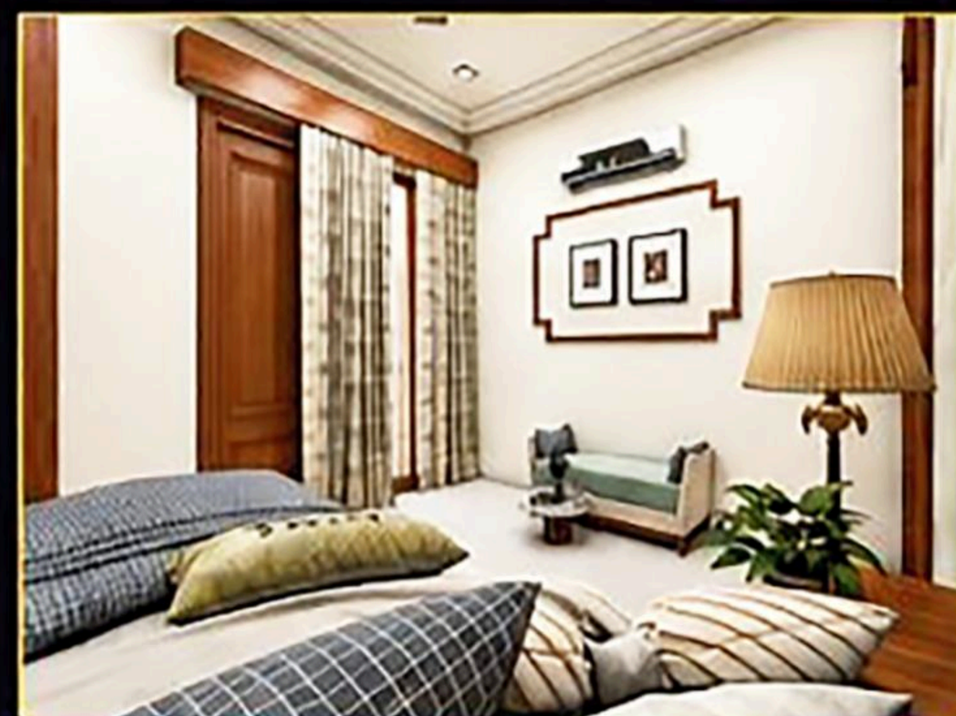
STUDIO APARTMENT INTERIOR