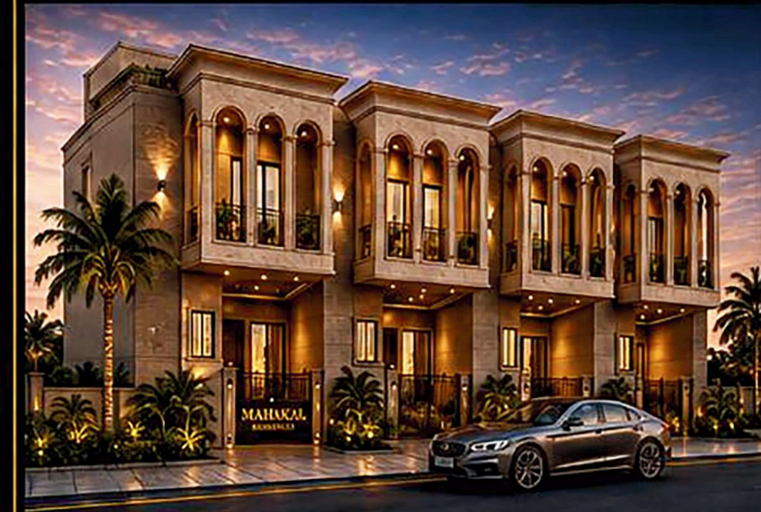
STUDIO APARTMENTS ELEVATION